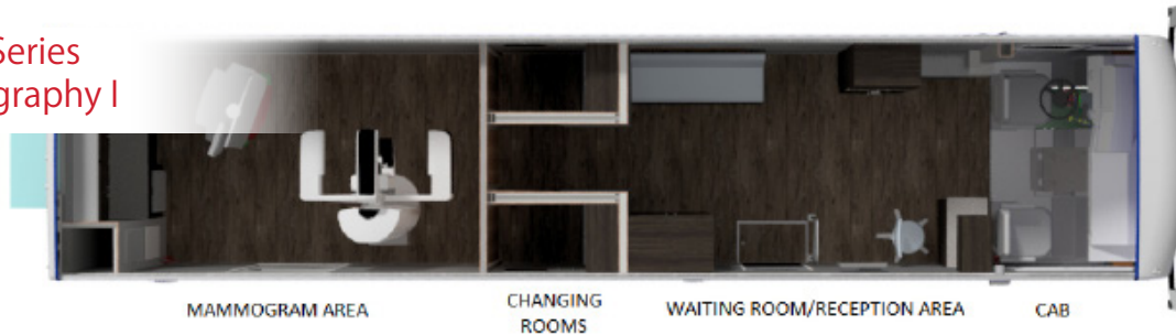
Premier Series Mammography I